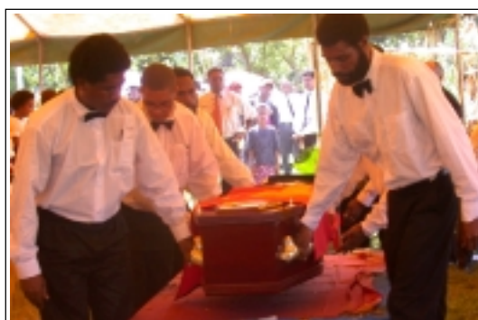
Pall-bearers lower Sir Alkan's casket for staff at NARI to pay their last respects at Bubia on Saturday, 30 August 2003

We rekindled that friendship in 1970 when I was posted to LAES Keravat (now NARI Wet Lowlands) in Sir Alkan's home province of East New Britain and this continued when I joined Sir Alkan's NARI Council in the late 1990s.