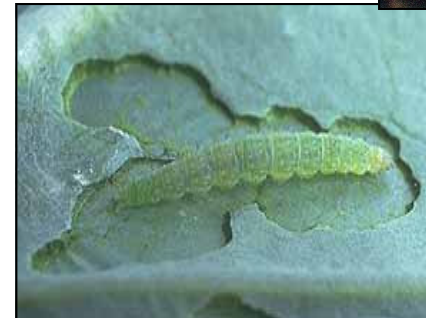
Piksa 2. Katapila bilong daimonbek mot I kaikai lip bilong kabis

BAI YU DAUNIM DAIMONBEK MOT OLSEM WANEM? Yusim Kabis IPM long daunim dispela binatang nogut.