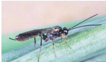
Piksa 3. Daidekma

Gutpela binatang em i save kaikai plawa. Olsem na yu mas larim grass na liklik diwai igat plawa arere long gaden bai gutpela binatang em stap.