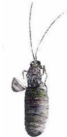
Piksa 4. Daidekma kam aut long karamap