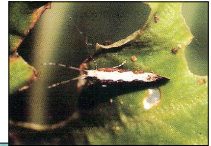
Piksa 1. Daimonbek