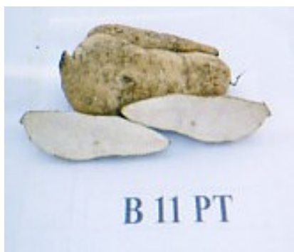
Piksa 1. NARI nambis kaukau 1

NARI i painim pinis 3-pela kain kaukau we i ken sanap strong long taim bilong bikpela san.