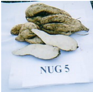
Piksa 3. NARI nambis kaukau 3