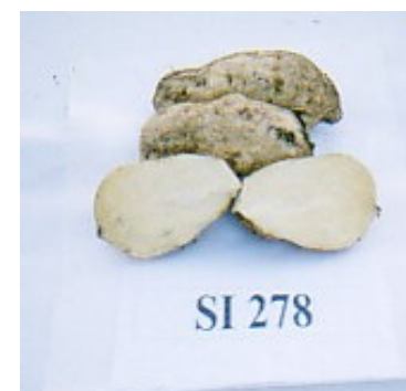
Piksa 2. NARI nambis kaukau 2

Fama i mas gat kain kaukau wantaim ol arapela strongpela kaikai olsem tapiok, kalapua, na yawa banana long rere oltaim long taim bilong bikpela san.