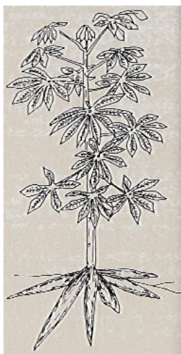
Piksa 3. Tapiok