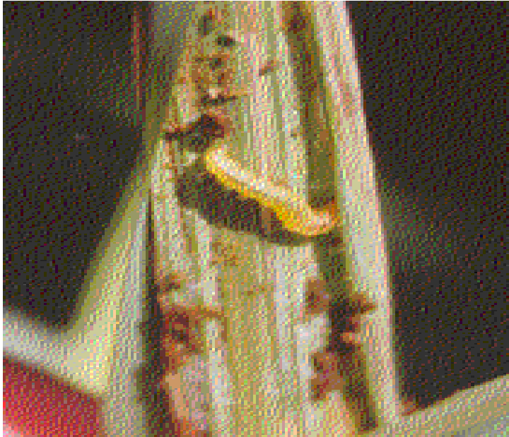
Piksa 2. Binatang katapila i stap insait long lip bilong rais

insait long dispela lip em i passim. Taim em i stap namel long dispela lip, em i save kaikai na bagarpim lip. Ol lip we binatang i bagarapim bai kamap wait. Taim planti binatang i stap, rais bai ino inap karim gut kaikai.