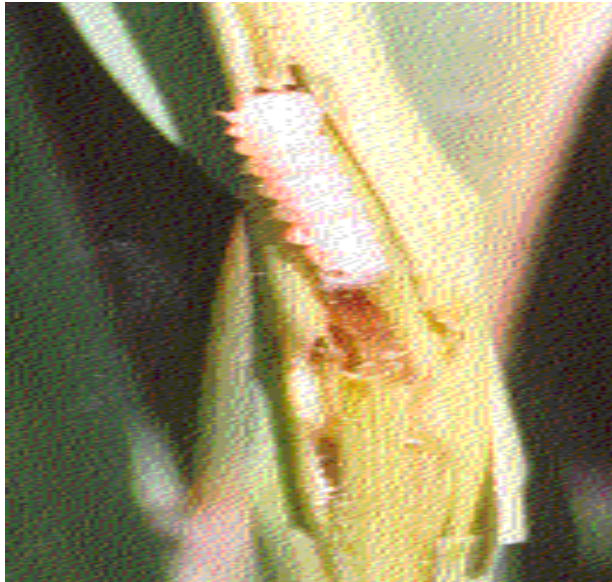
Piksa 4. Katapila bilong Stem bora i stap insait long bun blong rais

putim kiau insait long bun bilong rais. Taim pikinini i kamap, ol bai kaikai bun bilong rais. Kru bilong rais i bai drai na kamap wait. Sampela kain rais i no inap bagarap tumas long dispela binatang.