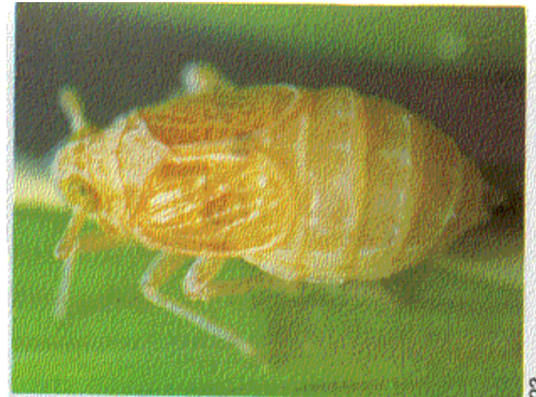
Piksa 1. Pikinini bilong Braun Plant Hopa

Dispela em i wanpela binatang i save pulim wara bilong rais na kamapim bikpela bagarap. Taim planti binatang istap na pulim wara bilong rais, rais bai i drai na kamap braun. Taim planti rais i bagarap, ol i kolim 'Hopa Ben'.