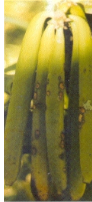
Piksa 5. Grei wivil i bagarapim bin bilong vanila

Ol mama na papa bilong ol dispela kain bitel i save kaikaim ol flawa na frut. Ol bitel ol i gat grei kala na ol i nogat wing. Ol i save wokabaut tasol igo antap long rop bilong vanila. Ol flawa na frut we binatang i kaikaim ol i save lus na pundaun nating.