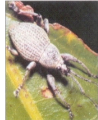
Piksa 6. Piksa antap soim wivil o bitel we i sindaun antap long lip bilong vanila