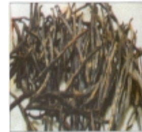
Piksa 7. Wivil i bagarapim bin bilong vanila