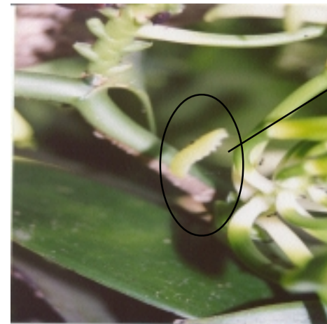
Piksa 2. Katapila i sindaun antap long rop bilong vanila

Igat wanpela grin katapila bilong dispela bataplai i save kaikaim ol flawa na yangpela frut bilong vanila. Mama bataplai i save putim kiau antap long ol yangpela kru na flawa, na taim kiau i bruk, katapila save kamap na kaikaim ol flawa na frut. Taim planti katapila i stap ol bai bagarapim stret ol flawa na frut.