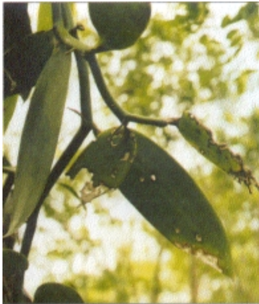
Piksa 1. Soim lip vanila we ol binatang i kaikai

Vanila em i wan famili bilong Okid flawa na i save kamap long ol ples i gat planti wara na ples ino kol. Rop bilong vanila em i save gro igo antap long narapela diwai na em i save laikim sampela sedo na gutpela graun i gat planti gris. Taim yu lukautim gut vanila bilong yu em i ken karim gut na wanwan diwai yu ken kisim olsem wanpela kilogrem bilong vanila i grin yet. Na gutpela vanila stret i gat gutpela prais long wold maket.