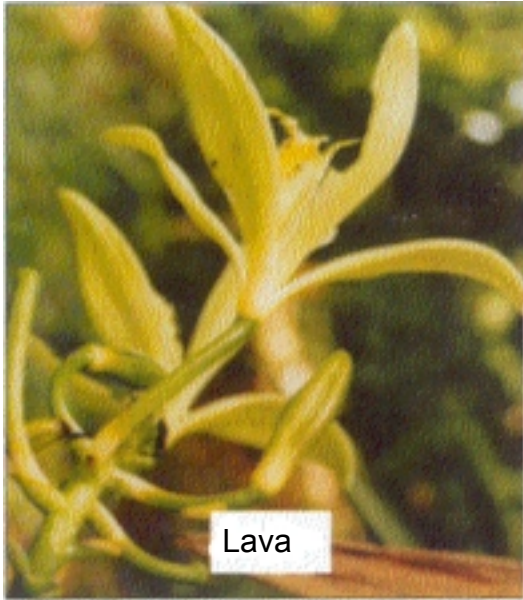
Piksa 3. Katapila i kaikai flawa i no op yet